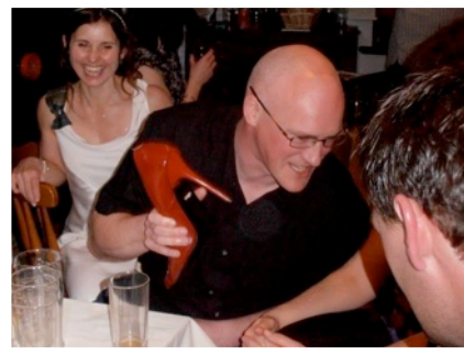
The Groom makes sure the wife has her own hair!